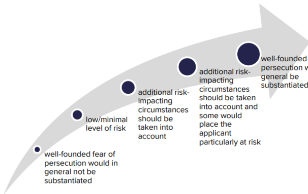
Figure 3. Conclusions with regard to level of risk (well-founded fear of persecution): indicative scale.

The conclusions regarding the level of risk could be broadly illustrated on an indicative scale, see Figure 3 below.