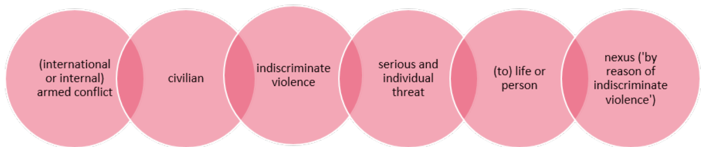
Figure 3. Article 15(c) QD: elements of the assessment.

The necessary elements in order to apply Article 15(c) QD are: