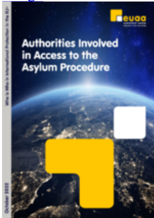
Authorities Involved in Access to the Asylum Procedure Image