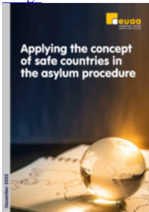
Applying the Concept of Safe Countries in the Asylum Procedure