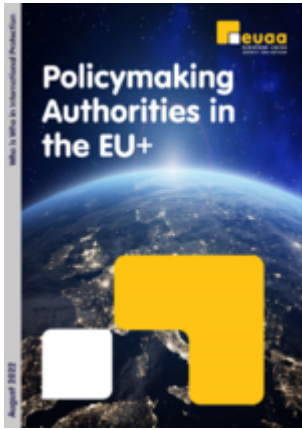
Policymaking Authorities Image