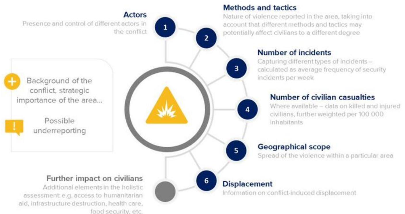
Figure 6. Assessment of the level of indiscriminate violence.

The indicators applied (see Figure 6) were initially formulated in reference to the ECtHR judgment in Sufi and Elmi and were further developed and adapted in order to be applied as a general approach to assessing the element of 'indiscriminate violence', irrespective of the country of origin in question. The CJEU judgment in CF and DN was seen as a confirmation of the appropriateness of the selected approach.