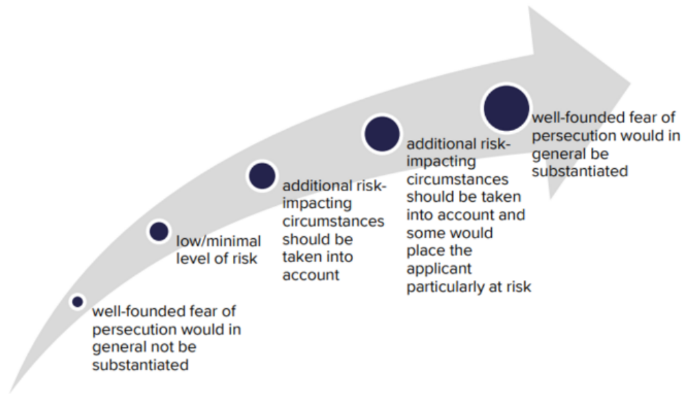
Figure 3. Conclusions with regard to level of risk (well-founded fear of persecution): indicative scale.

Note that an individual examination is required in all cases.