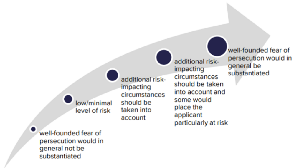
Figure 3. Conclusions with regard to level of risk (well-founded fear of persecution): indicative scale.

Note that an individual examination is required in all cases.