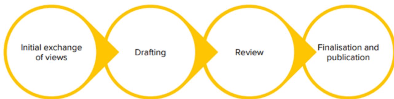
Figure 2. Elements in the country guidance development and update processes.

The main stakeholders in this process are the EU Member States and associated countries. Their representatives at senior policy level are nominated to the EUAA Country Guidance Network , in the context of which they take part in the development, review, and update of each country guidance document. Furthermore, national administrations nominate experts who support respective processes as part of dedicated drafting teams . National experts on exclusion are further consulted via the EUAA Exclusion Network.