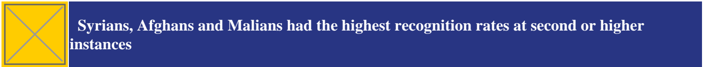
Figure 4.24: Recognition rates in EU+ countries at first instance and second or higher instances by top nationality, 2020

In absolute numbers, far fewer positive decisions were issued overall at second or higher instances than at first instance, but eight of the top 20 nationalities in Figure 4.24 received more positive decisions at second or higher instances than at first instance.