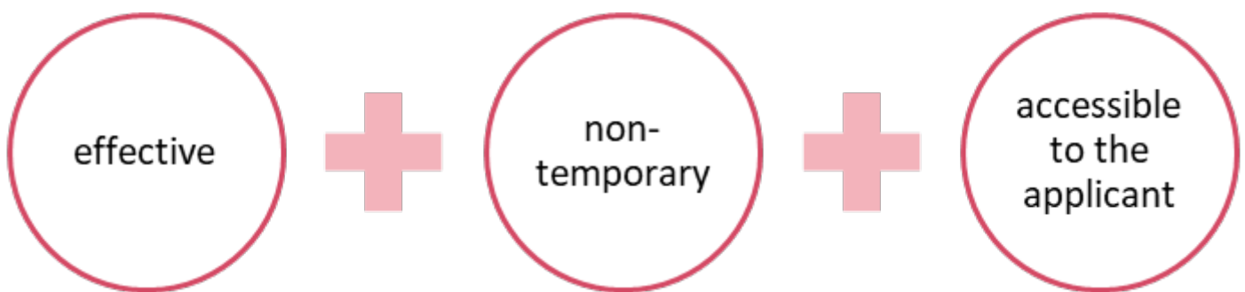
Figure 13. Requirements to the protection in the country of origin in accordance with Article 7 QD.

It should also be kept in mind that effective protection is presumed not to be available where the State or agents of the State are the actors of persecution or serious harm ( Recital 27 QD ).